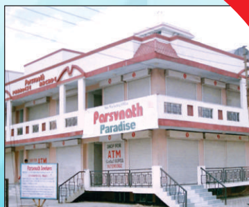
Parsvnath Paradise Arcade, Mohan Nagar.