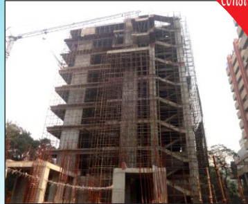
Parsvnath 27, K.G. Marg, Delhi