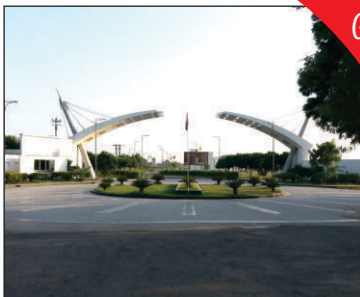
Parsvnath City, Dharuhera