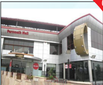
Parsvnath Mall, Kashmere Gate.