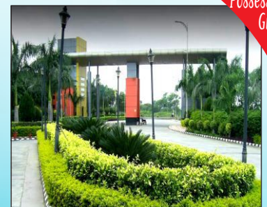
Parsvnath City, Indore