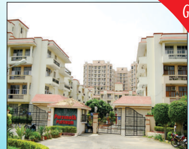
Parsvnath Platinum Towers, Greater Noida