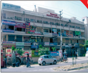
Parsvnath Majestic Arcade, Ghaziabad.