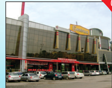
Parsvnath Mall, (Annexe.), Inderlok