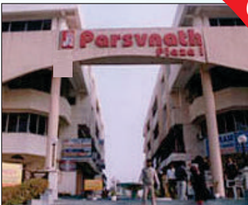
Parsvnath Plaza - I, Moradabad.