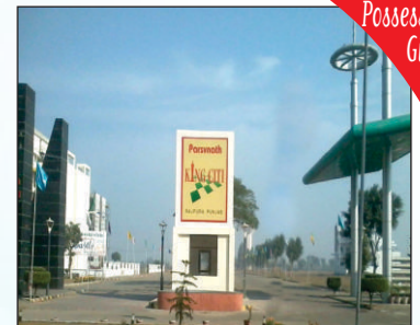
Parsvnath King Citi, Rajpura