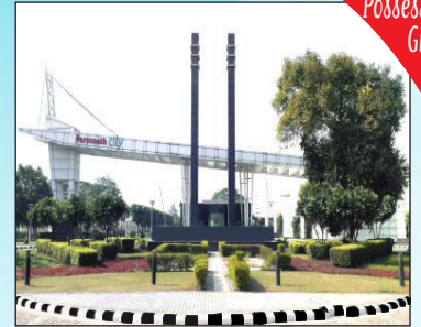
Parsvnath City, Sonapat