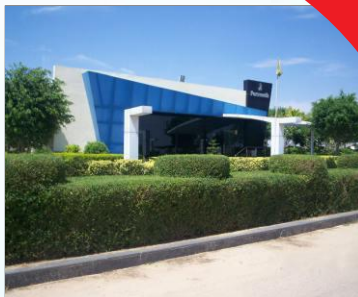
Parsvnath City, Jaipur