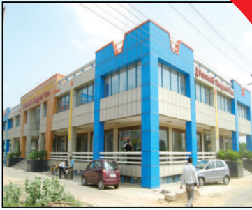
Parsvnath Shoppers Den, Noida.