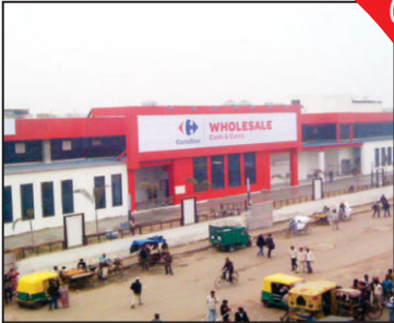
Parsvnath Mall, Seelampur.