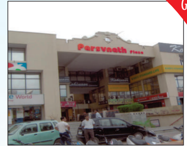
Parsvnath Plaza, Court Road, Saharanpur.