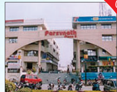
Parsvnath Plaza - II, Moradabad.