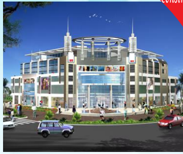
Parsvnath Mall, Rohini, Delhi