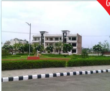
Parsvnath Green, Derabassi