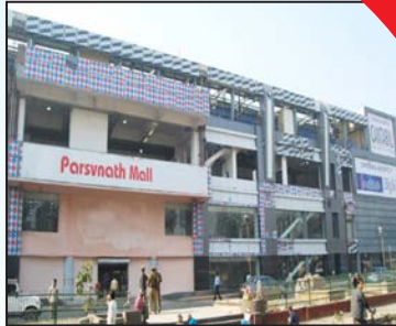
Parsvnath Mall, Azadpur