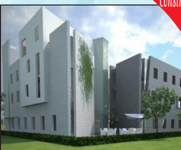
Parsvnath Hotel, Shirdi