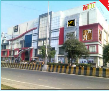
Parsvnath Mall, Moradabad.