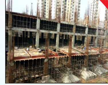
Parsvnath Technica, Gurugram