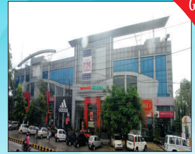
Parsvnath Eleganza, Deharadoon.