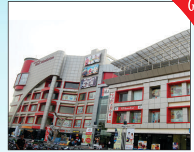
Parsvnath Mall Manhattan, Faridabad.