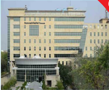
Parsvnath Capital Tower, BVSM, Delhi