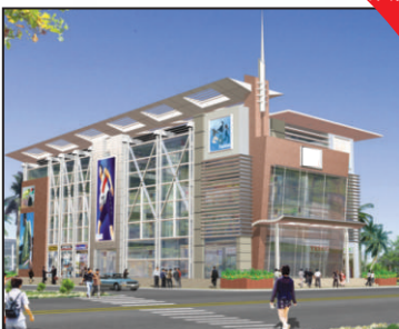
Parsvnath Square, Moradabad