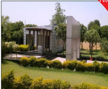
Parsvnath Paliwal City, Panipat