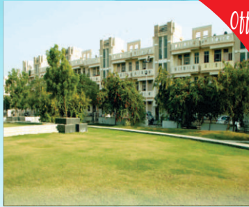
Parsvnath City, Jodhpur