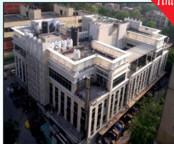
Parsvnath Capital Tower, Ph-2, Delhi