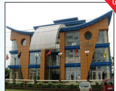
Parsvnath Kaushambi Mall, Ghaziabad.