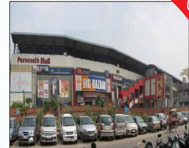
Parsvnath Mall, Inderlok.