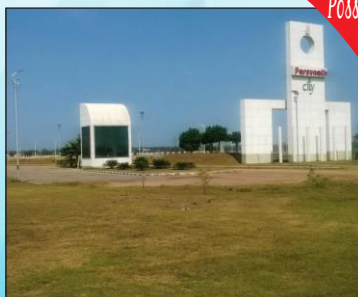
Parsvnath City, Rohtak