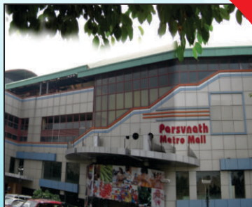
Parsvnath Mall, Tis Hazari.