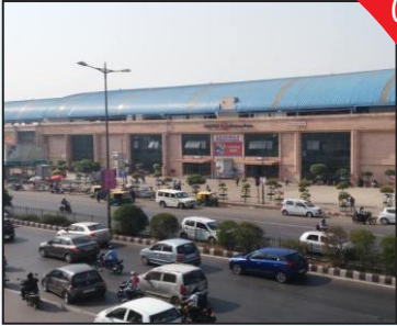
Parsvnath Mall, Akshardham