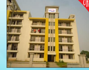
Parsvnath Regalia, Ghaziabad