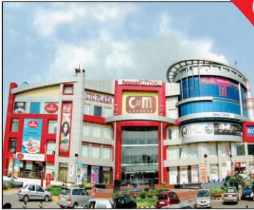
Parsvnath City Mall, Faridabad.