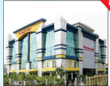
Parsvnath Tower Shahdara, Delhi