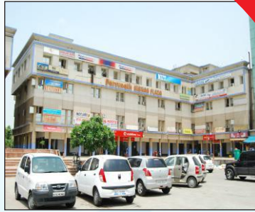
Parsvnath Bibhab Plaza, Greater Noida.