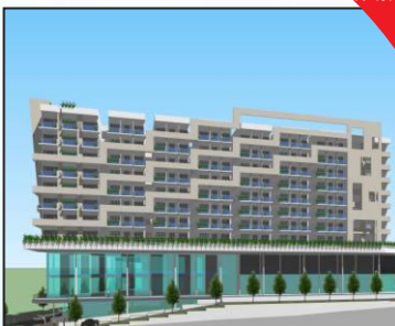
Parsvnath City Centre, Hyderabad