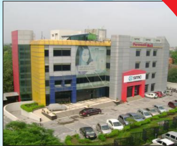
Parsvnath Mall, Pratap Nagar