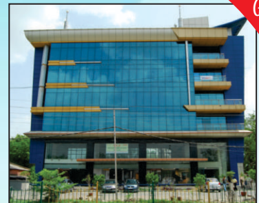
Parsvnath Arcadia, Gurgaon.