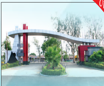
Parsvnath City, Ujjain