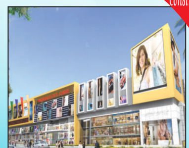
Parsvnath City Centre, Sonapat