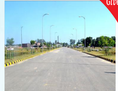
Parsvnath City, Saharanpur