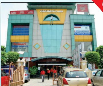
Parsvnath Plaza, Noida.