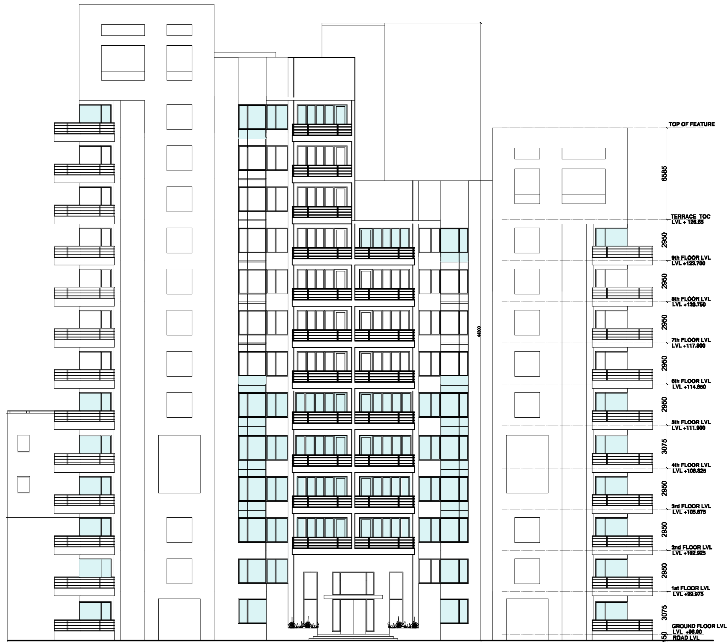
FRONT ELEVATION D6