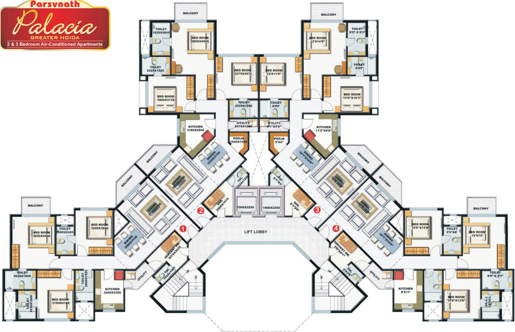
TYPICAL FLOOR PLAN Tower No. A1, A2, A3 & A4 Accommodation : 3 Bedroom + Servant Area : 1835 sq. ft.