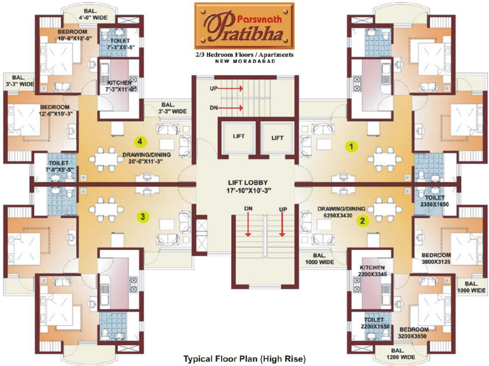
Typical Floor Plan (High Rise) 2 Bedroom + 2 Toilet (S + 7 & 9) Saleable Area : 1005 Sq. Ft.

2/3 Bedroom Floors / Apartments NEW MORADABAD