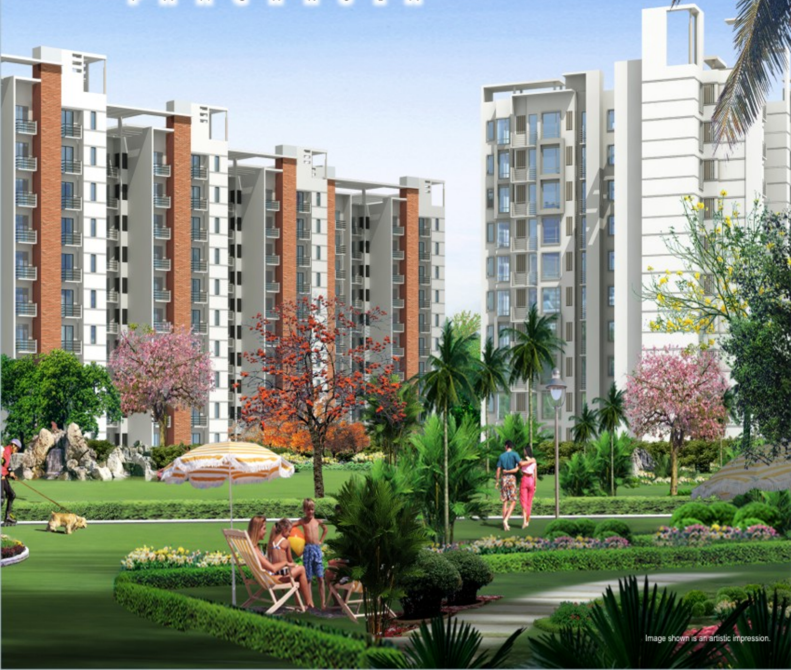
Image shown is an artistic impression.