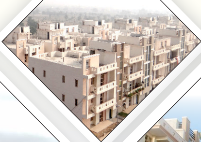
Actual Site Photographs

Parsvnath City is an aesthetically designed and well planned township which captures the true spirit of Jodhpur. Equipped with modern infrastructure and high end recreational facilities, the township is a self-contained mini-city where over 150 families reside.