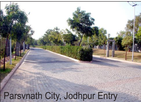
Parsvnath City, Jodhpur Entry

Parsvnath Developers Ltd brings to you an opportunity to own your dream home in a fully functional, integrated habitated township of Jodhpur at pocket friendly prices.