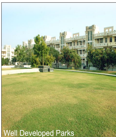
Well Developed Parks

Here comes a chance to be a part of affordable housing in low rise floors in Parsvnath city-“the pride of Jodhpur” having well-manicured lawns/parks, broad well lit metaled roads, purposed, club, temple & shopping within the township that enjoys world class underground infrastructure and 24 X 7 security in a gated township, located on pal sangariya bypass.